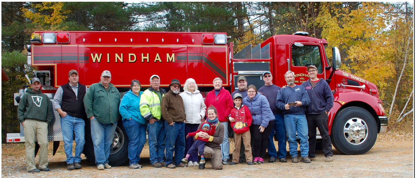
Windham Fire Company in front of new truck!