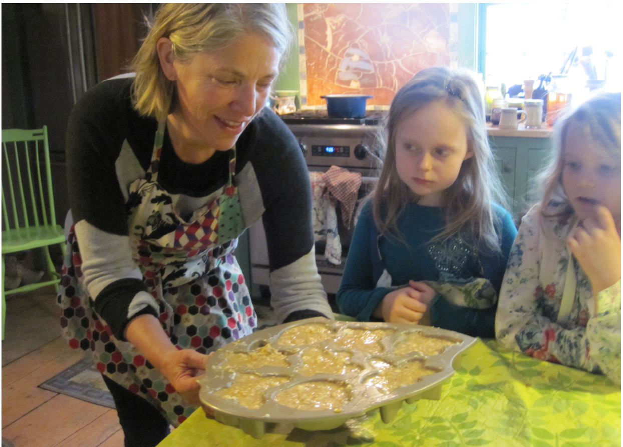
WES students learn to make cornbread at Meadows Bee Farm